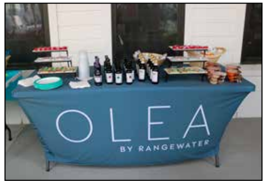
Refreshments are served at the After Hours event.